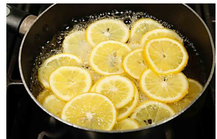
How To Fix Your Fatigue (Do This Every Day)