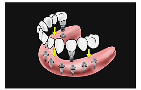
Here's What New Dental Implants Should Cost You - View Pricing & Dentist...