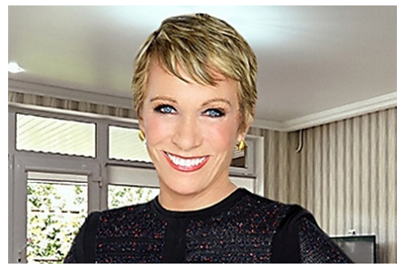
"Shark Tank" Star's Brilliant Tip On Paying Off Mortgage