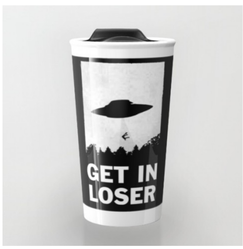
For this week's second prize, a lowercase-loser mug.

Those ever so helpful clarifications arrived via Style Invitational Week 330, in the summer of 1999. That contest was inspired by those less imaginative pedants who pointed out incessantly that the next century would not start on New Year's Day 2000, but on New Year's Day 2001. Eighteen years later, nobody cares anymore when this century started (okay, maybe you do) but surely there's plenty to faux-quibble about that would make even confirmed acunerds (see today's Week 1216 results) roll their eyes (but how can they roll with so much connective tissue around the iris?). This week: Give us some humorous pedantry , as in the examples above. Don't make them any longer than those; shorter ones are welcome.