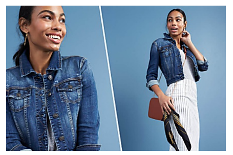
Optimize Your Stitch Fix: 10 Ways to Make Your Closet Awesome